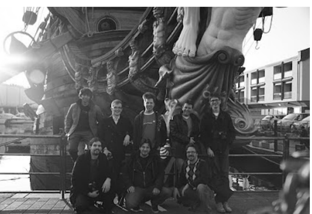
digiKam Sprint Team

may involve quality loss.) Thanks to this work, digiKam also gained multi-threaded metadata editing to go along with multiple-core CPUs. "I figured out a way to distribute the work—based on inter-thread Qt signals and slots—to multiple threads without having to change the existing code. The solution