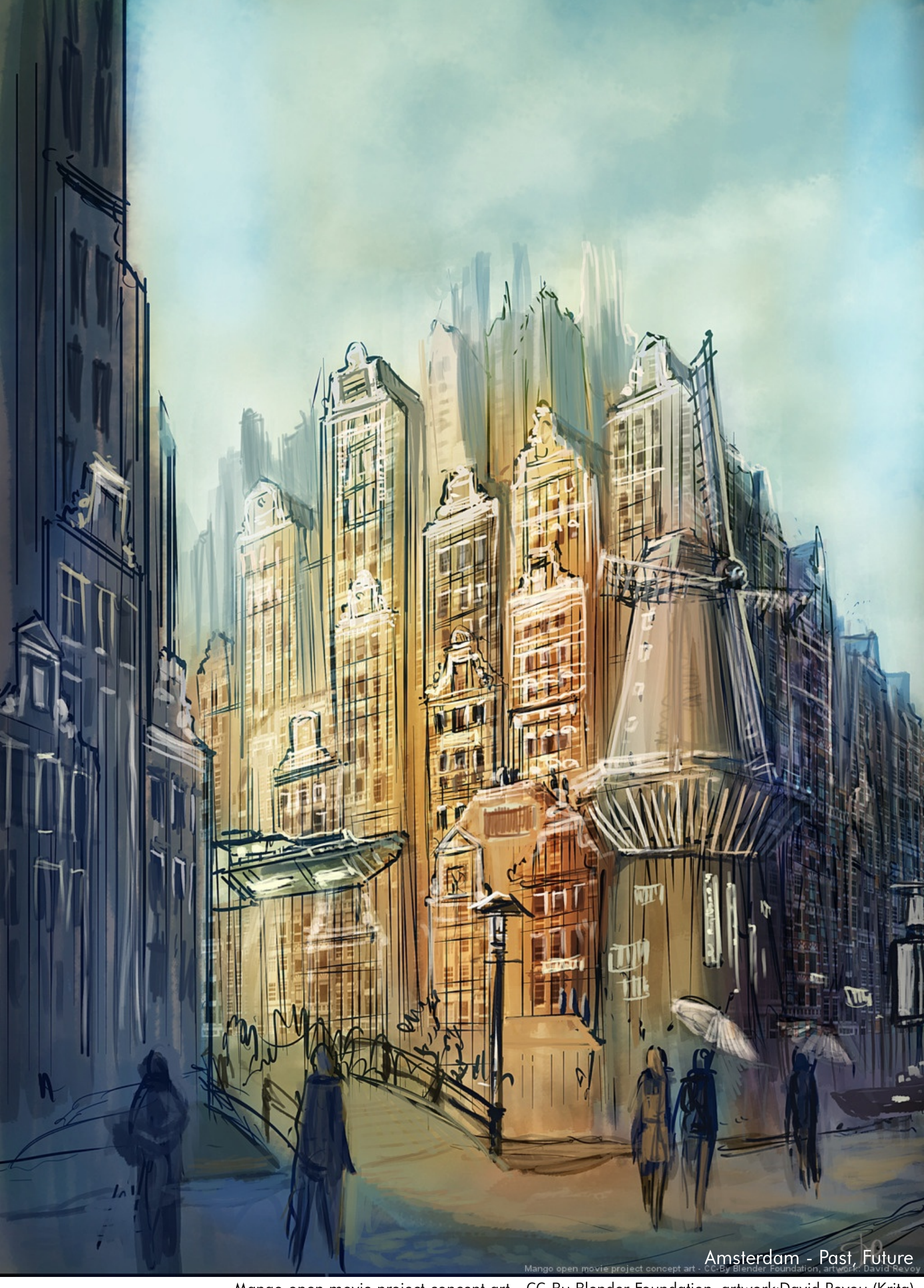
Mango open movie project concept art