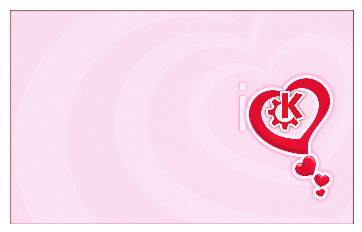
Happy Valentine's Day

Learning about the wonderful KDE family was highly encouraging and motivating for all, and elicited enthusiastic response from the attendees, many of whom resolved to become a part of KDE. Lots of thanks to KDE for making our event a huge success!