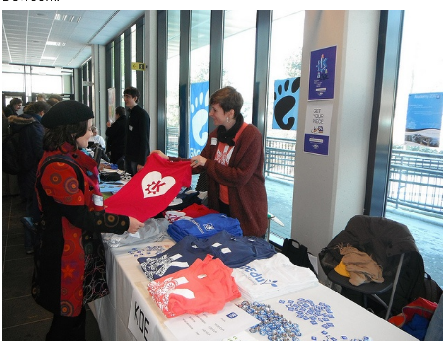
KDEWear at FOSDEM

As in recent years, KDE had a large presence at FOSDEM. There were more than 20 KDE folks present, staffing the KDE booth, milling in the hallways or giving talks in the Cross-Desktop Devroom.