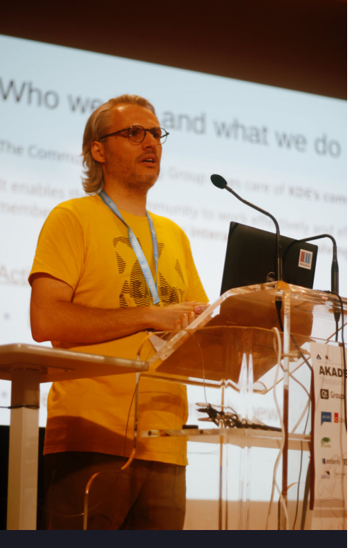
The KDE Community and KDE e.V. are seeking a host for Akademy 2025.