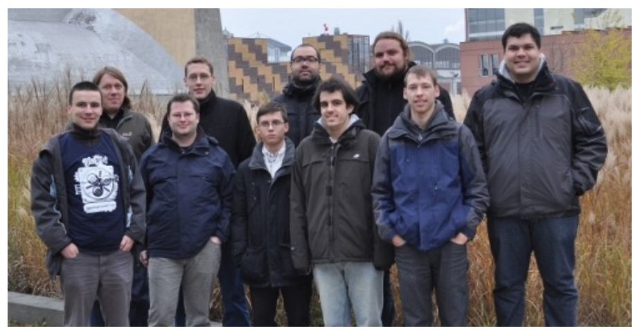
KDE on Mobile Sprint Team

When it came time to turn to individual projects: