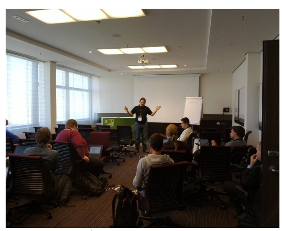
Qt Contribution Day

http://booki.flossmanuals.net/kdeguide/, create an account, and help us make it better!