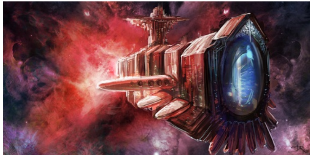
Art with Krita

20 students finished their projects sucessfully and will receive a tshirt and certificate in the next weeks. Given the extremely low barrier to entry, this is an amazing success rate and more than double compared to last year. Some of SoK participants were also able to attend the Desktop Summit in Berlin and present their project in front of a large audience - a first for all of them. They did great and spread their enthusiasm among all attendees. We're excited to again have been able to introduce many new people to Free Software and KDE in particular and hope that many of them will stay with us and accomplish great things. They've shown they're capable of that.