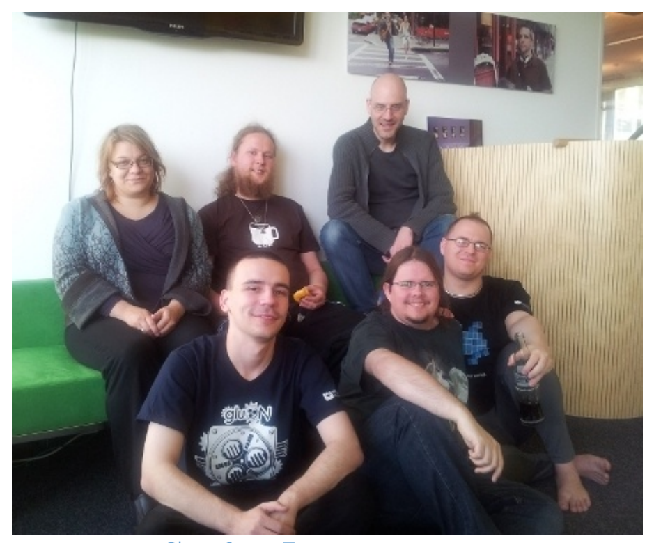
Gluon Sprint Team

talked about the Gluon Player organization being too much like an experiment. Now that we are reaching a serious state, we considered seriously how to organize this collection of applications. A consensus was reached to retire some of the experiments and to restructure others. A transcript of this discussion can be found on the Gluon Player wiki page. The core result is that there will be one player installed on any platform called Gluon Player in the .desktop file. We also discussed the potential for constructing a generic settings system for games, which would allow for cross platform friendly settings dialogues and the like, and the possibility of moving Gluon from the playground section to extragear (the sysadmin team willing, of course).