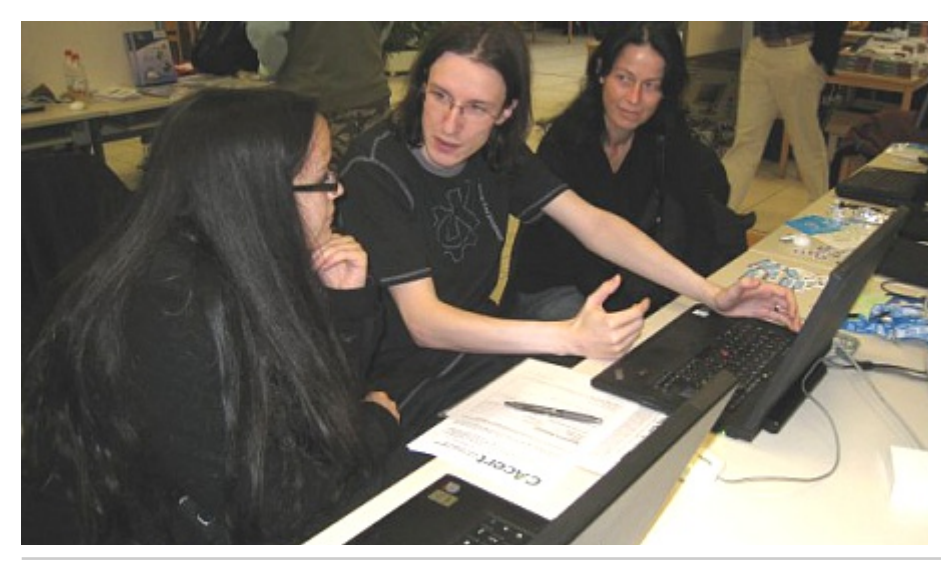
KDE eV Community Report | Issue 16 | 4th Quarter, 2010

Left, Users showcase KDE to interested attendees at LinuxDay 2010.