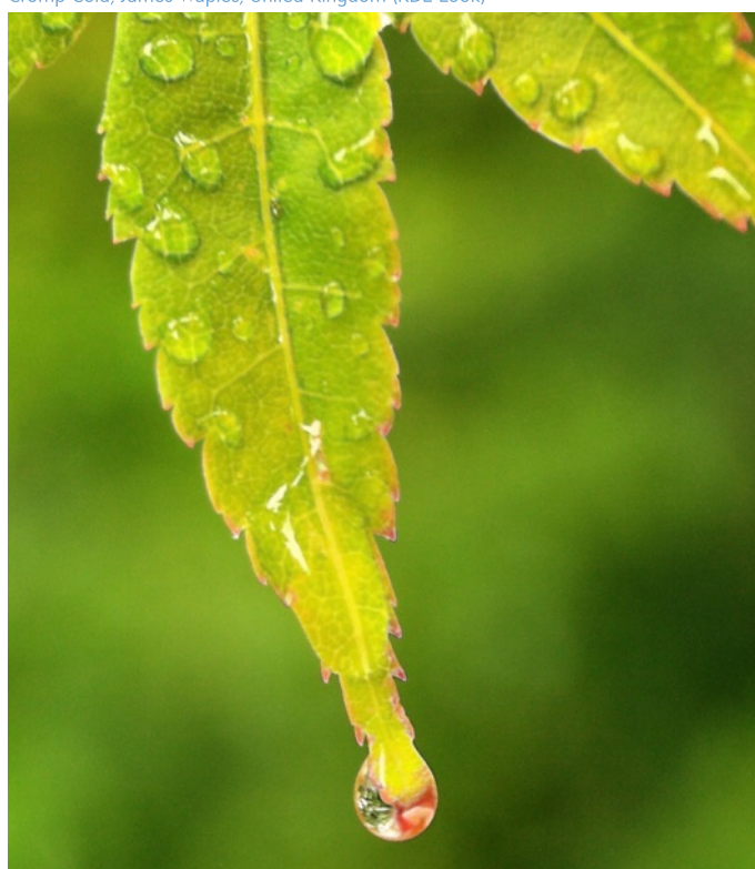
Drop, Kanwar Plaha, Australia (KDE Look)