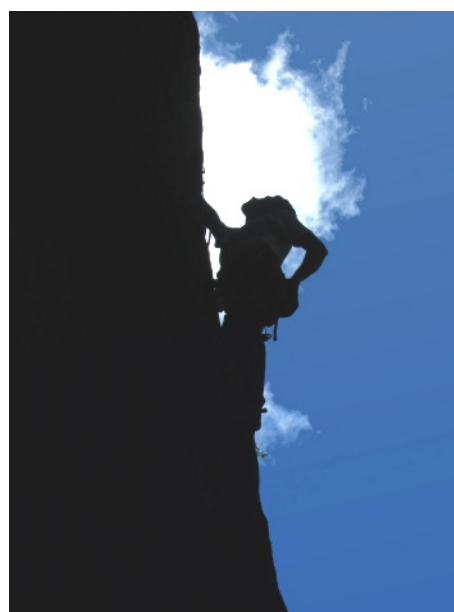
Climbing, Jao Seixas, Brazil (KDE Look)